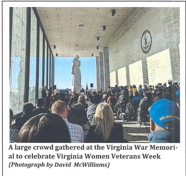
A large crowd gathered at the Virginia War Memorial to celebrate Virginia Women Veterans Week