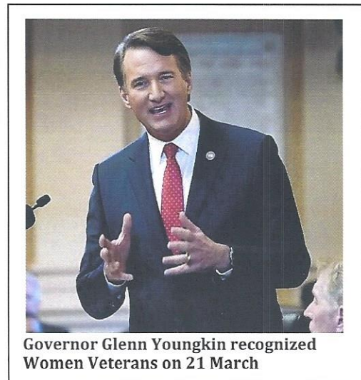
Governor Glenn Youngkin recognized Women Veterans on 21 March

"As a woman veteran, I fully understand the unique challenges that our women veterans face when they transition to civilian life," said Lieutenant Governor Earle-Sears. "Our Commonwealth is blessed to have the largest percentage of women veterans per population of any state. Each brings along the skills and talents learned during their military service to their new roles in our local